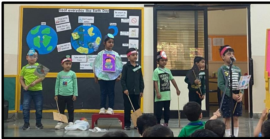
Green Warriors of Santa Maria