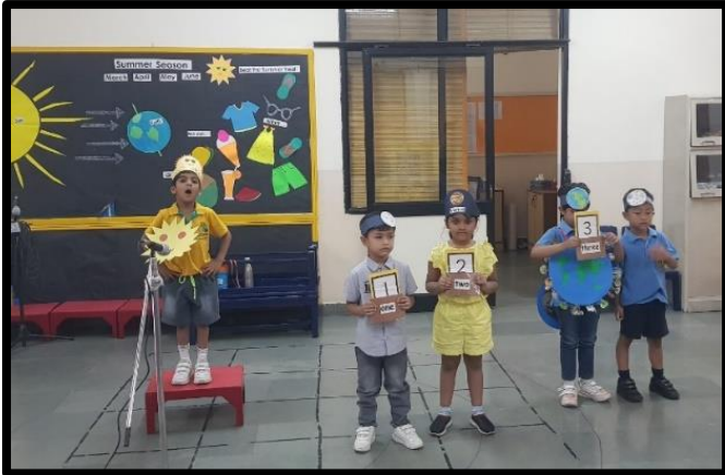
Presentation on the solar system