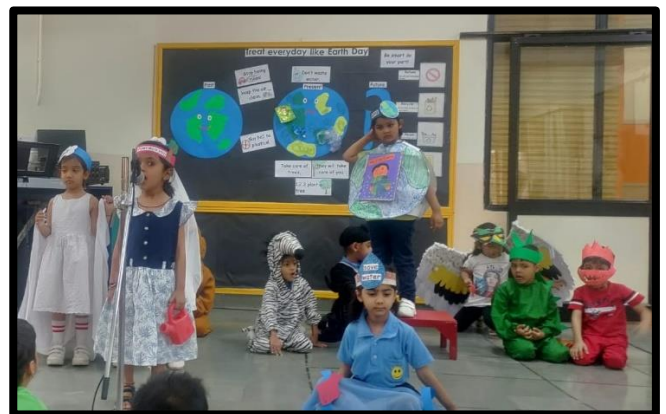
Skit on Earth Day by Prep B – Future of earth is in our hand... Every action counts