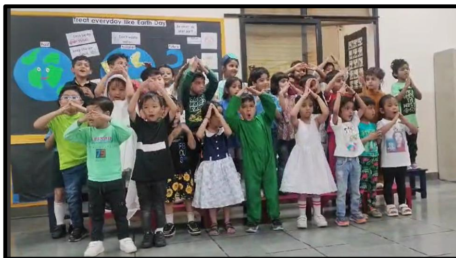
Children singing the song – Earth is home to you and me...