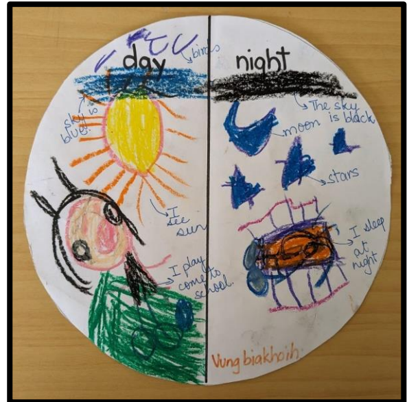
Recall – Day and night