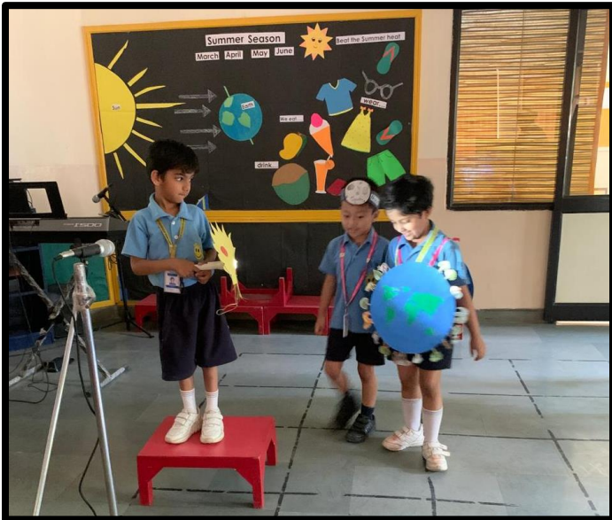
Understanding how day and night occurs

We discussed important concepts related to our planet like how day and night occur, how seasons change, and what are the different land forms found on Earth. This helped children to relate these concepts to real life experiences.