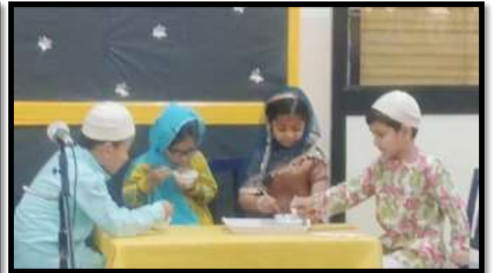
Starting of festivities