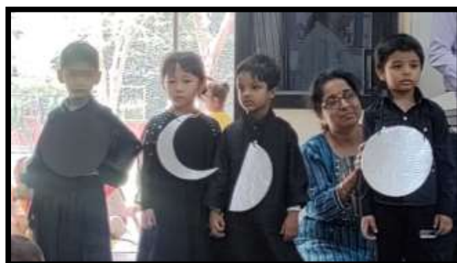
Phases of the moon