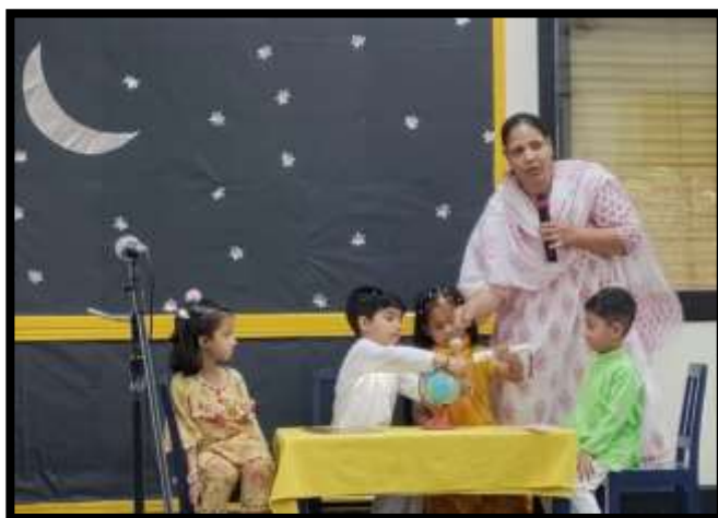
Sighting of the moon