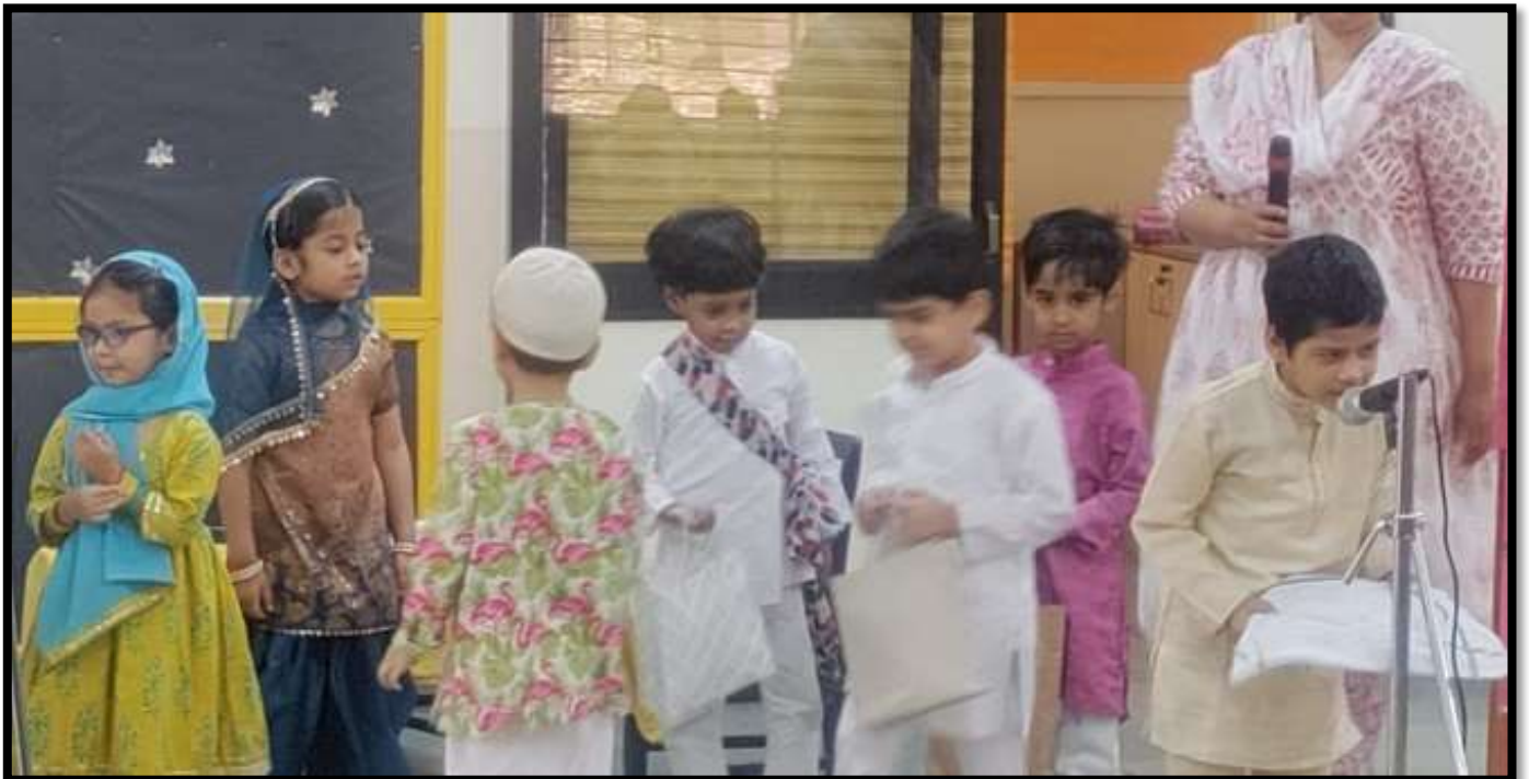
Distributing of the Zakaat-al-fitr